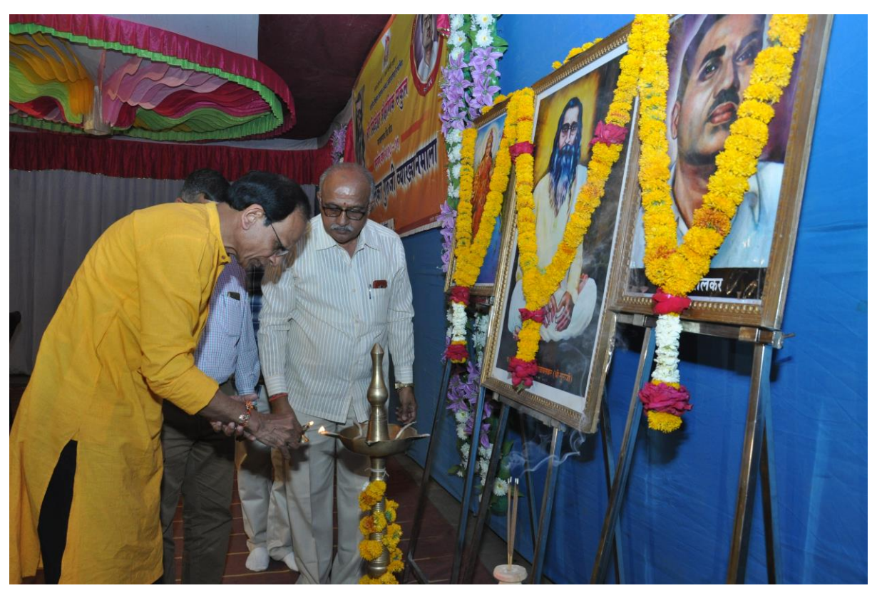
Shri Anilji Bokil inaugurating the Vyakhyanmala 2018-19 and expressing his thoughts on Economic revolution for enriching life style